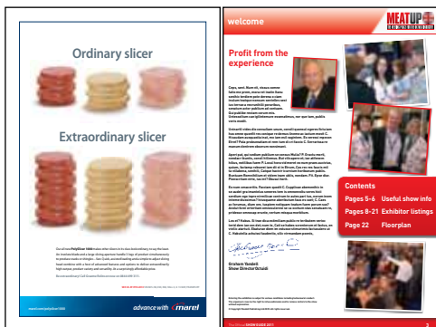
▲ How your advert could look in the catalogue.